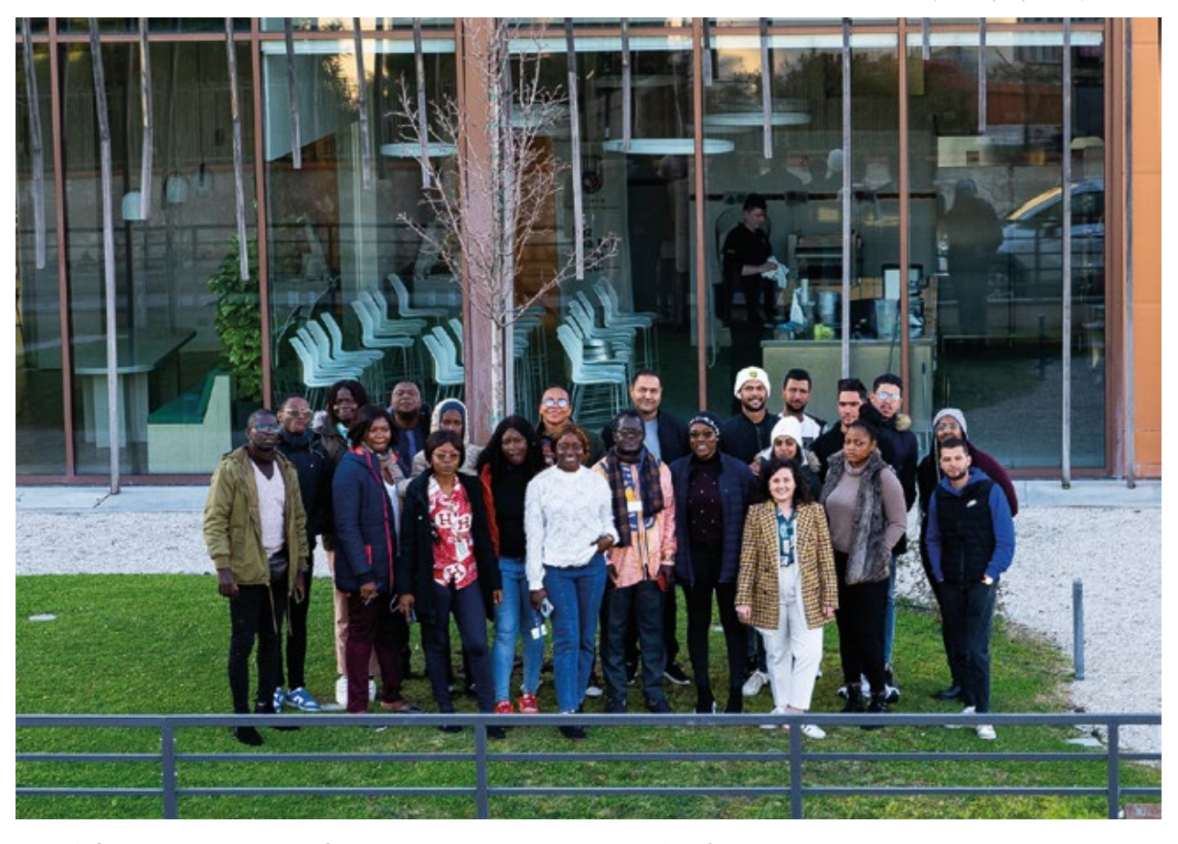
Figure 2. Students and graduates from Cameroon and Tunisia at the headquarters of FMTS Experience, Pontecagnano Faiano (Italy)

The general aim of the project is that of contributing to the exchange of good practices between the European and African VET Schools/training providers and to act on the strengthening of the links between the African VET system and the labor market. To pursue this goal, OVERSTEP foresees the mobility of 80 African staff members, 80 European staff members, and 200 African learners (100 students and 100 recent graduates). European/African teachers will be involved in a 15-day job shadowing experience in African/European schools while the African learners will have the opportunity of a "on the job" training experience in European companies operating in the sectors of Tourism and Hotel services, Agriculture and Food Processing.